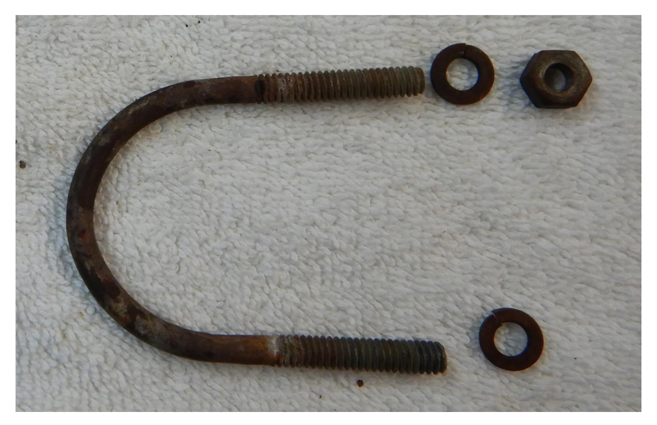
Figure 3: Rusted U Bolts. I hate to think how many of these I've seen twist off because the bolts were so baldy rusted