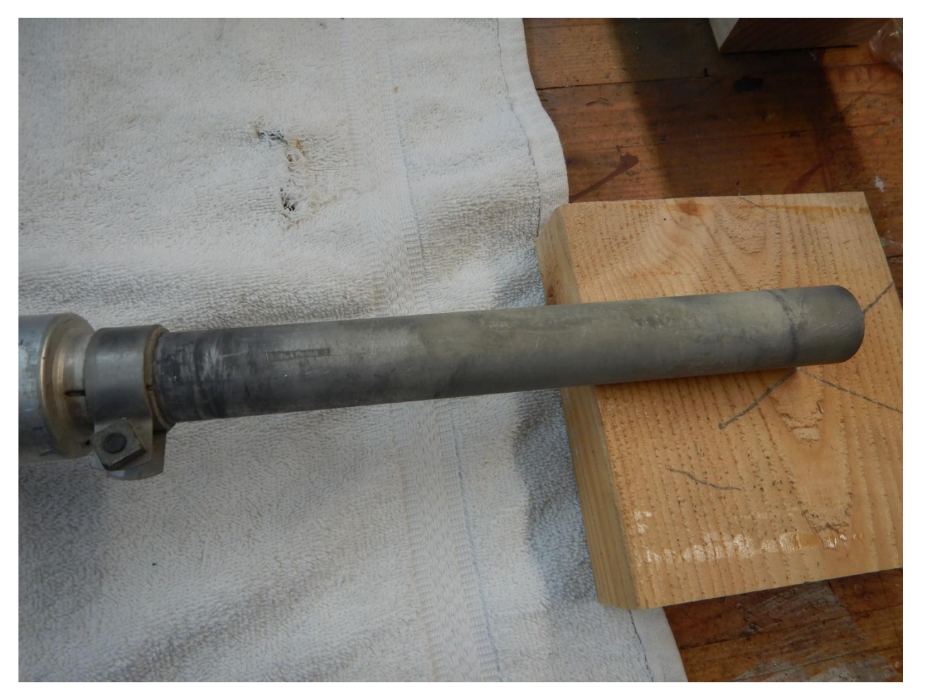
Figure 1: Extreme Corrosion at element connection points

Findings: I began by separating the antenna at each of it joints. At each joint where one element slips into the other I found extensive corrosion. Of particular note is at the first joint at the base of the antenna. For extra strength hustler used what I believe is a stainless steel pipe that extends through the base and at least a foot into the first aluminum element. There the corrosion was at it worse. I suspect the issue is what we call galvanic action. Although the picture below is not of the specific corrosion I was referring to it is representative of the corrosion I found on virtually every connection point on the antenna. Corrosion inhibits the flow of power throughout the antenna and can waste valuable energy. In the worst case it can inhibit the flow of energy altogether. This kind of corrosion is why we sometimes see fluctuation in SWR and intermittent performance. This kind of corrosion can be minimized by using an anti-oxidizing compound like Penetrox or Jet-Lub and where possible sealing the connection with self-vulcanizing tape in an effort to keep water out of the connection.