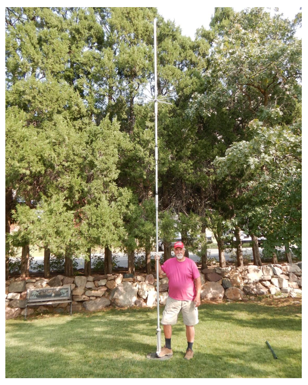
Figure 10: The finished antenna ready to be put back into service.

Engineering version of the manual is one of the finest and most complete manuals I've ever seen. Note that even they recommend the use of Penetrox ;-)