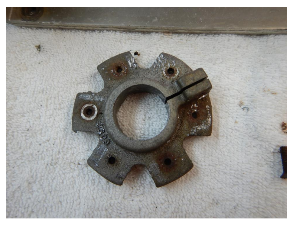
Figure 7: The spider hub before restoration