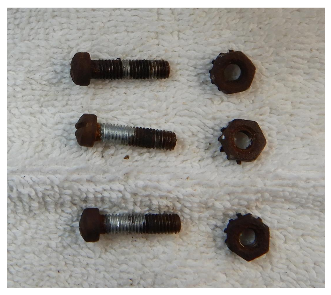
Figure 5: Badly rusted metal fasteners – These aren't the worst ones