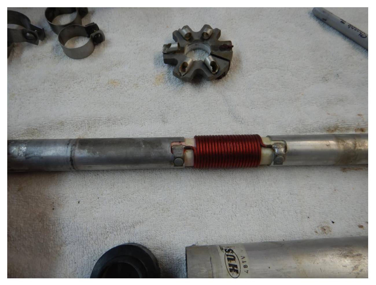
Figure 2: Examples of more corrosion found inside the traps

The second issue I found was the use of non-stainless steel components. In most cases this is the fault of the manufacture more than the builder. In the case of the Hustler antenna there were several examples of this. The screws had so badly rusted that it was not possible to unscrew the fasteners and instead a chisel had to be used to remove the screws.