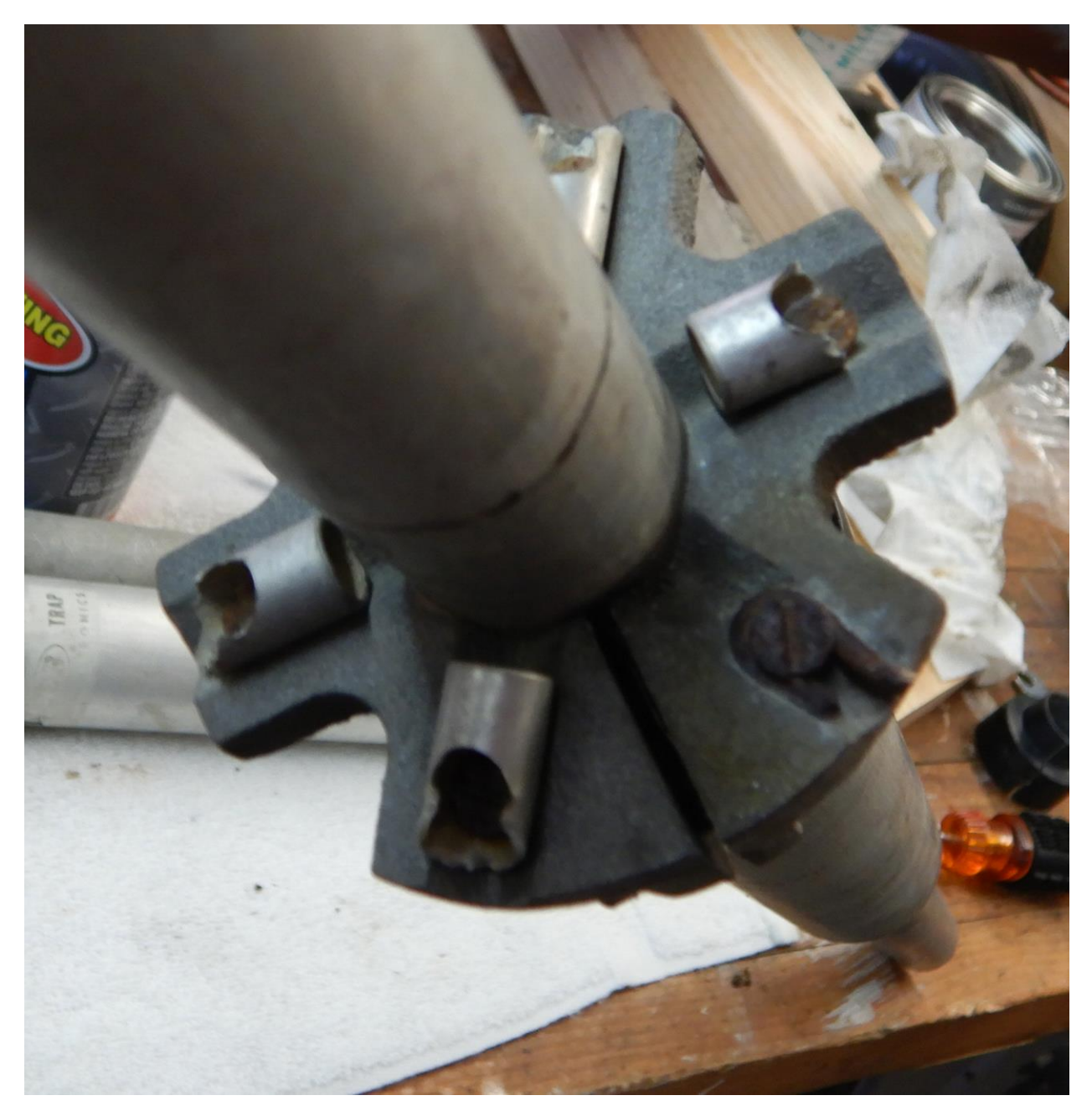
Figure 4: A view of the spider hub. The slots in the screws have all but rusted away!