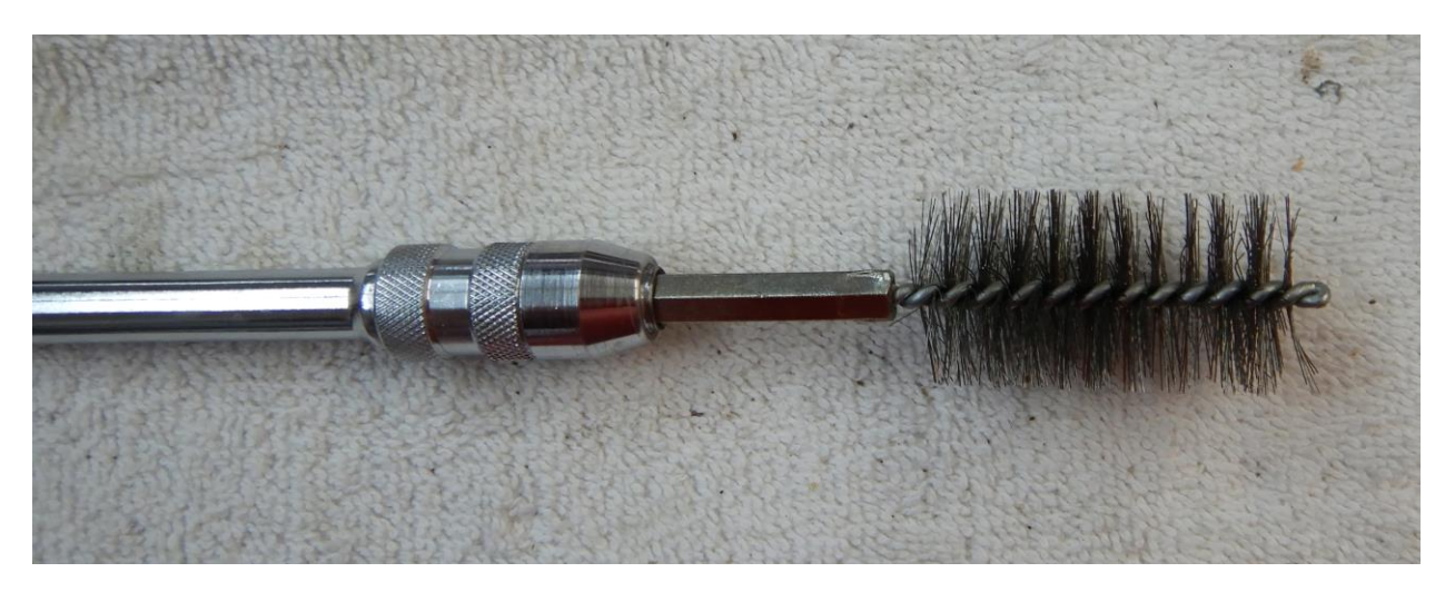
Figure 9: Tubing Cleaner attachment

I replaced all non-stainless steel nuts and bolts with a proper stainless steel equivalent. To each bolt I put a dab of anti-seize compound before assembly. I also replace all the element clamps with new stainless steel hose clamps.